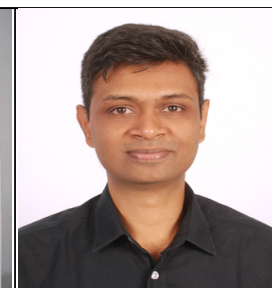
Test Day Photo